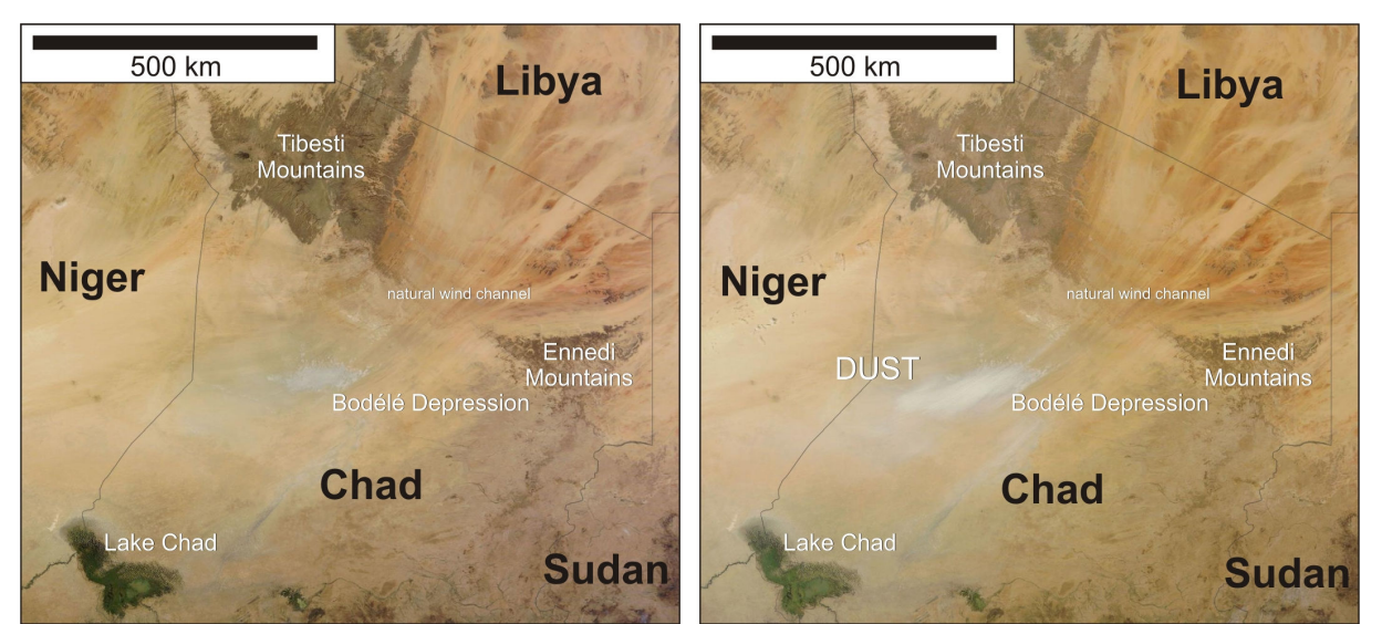
Figure 2 NASA MODIS Satellite images of Bodélé Depression on a "clear" (1 January, 2014) and a dusty day (6 February, 2014).

Seasonally flooded, ephemeral salt and dry lakes (chotts, sebkhas) represent another (very similar to previous) geomorphological environment suitable for severe dust emission episodes. These, mainly isolated, relatively small dust hot-spots can be found in lowlands, often surrounded by mountainous areas (source areas of water in spring from thawing). A typical example is the "Chott Region" in North Africa, south of the Tell Atlas. Chott Melrhir and Chott Jerid (1.6. on Figure 1 ) are salt lakes, with changing shores and are dry for much of the year. Strong winds associated with Sharav cyclones transporting huge amount of mineral dust from the lakebed towards the Mediterranean (ALPERT, P. –ZIV, B. 1989). Sand bombardment (particles from Grand Erg Oriental) plays also important role during the initial stage of wind erosion.